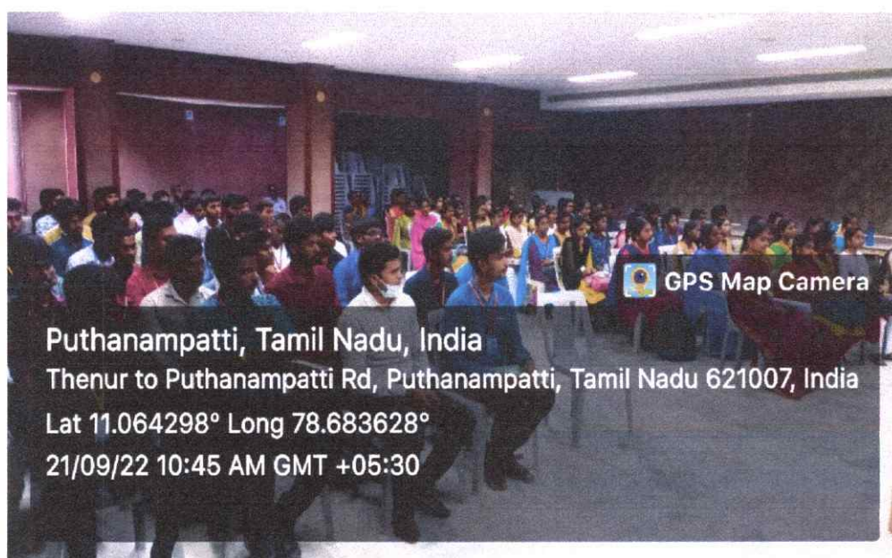
A Section of the Participants